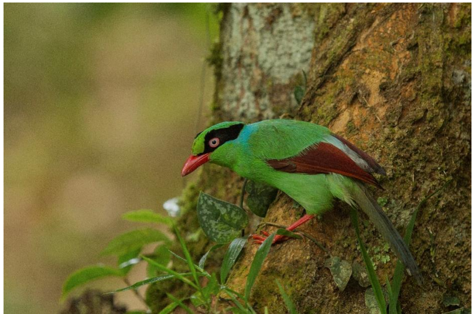
Short-tailed Green Magpie

After breakfast, we'll checkout and transfer to the town of Lahad Datu by 8:30am. Upon arrival, our group will register at the Borneo Rainforest Lodge Lahad Datu office and then continue another 2 hours overland journey to the lodge. Along the way we'll enjoy the transitioning landscape of regenerating forests to virgin rainforests of millions of years old. We'll check into the lodge and settle in to meet our local guide