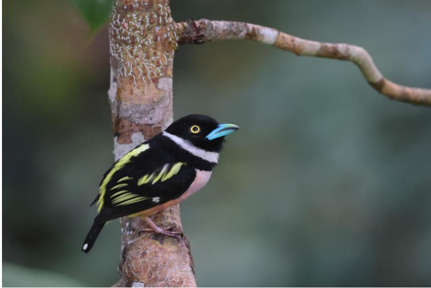
Black and Yellow Broadbill