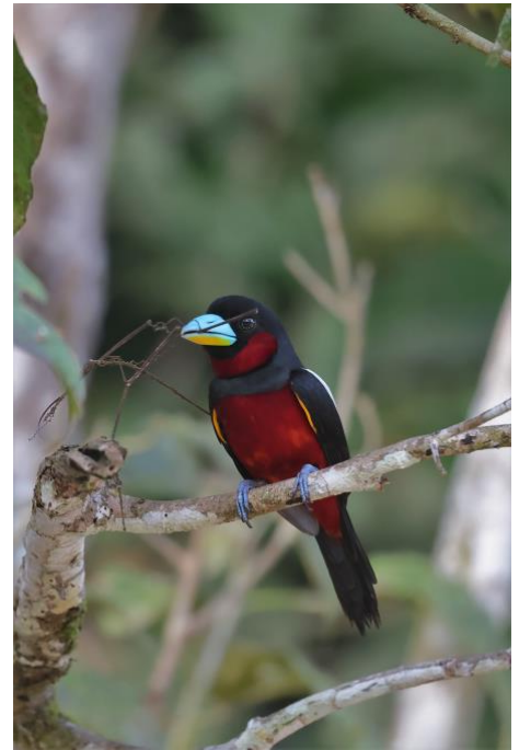
Black and Red Broadbill

Today will begin with some early morning birding at Kinabalu National Park. We'll explore the various trails at the base with our guide - the park is a birdwatcher's paradise with about 326 species, which represents more than 50% of bird species in Borneo. After lunch we'll embark on some afternoon birding at the headquarters area exploring the various trails – Power Station Road (4.5km), Kiau View trail (2.5km), Liwagu River trail (5km), Silau-Silau trail (3km), Bukit Ular (1km) and Pandanus trail (0.5km).