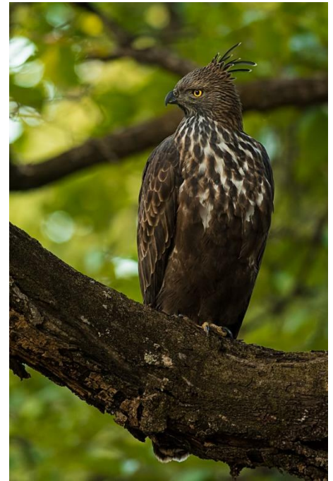
Crested Hawk Eagle

and Dhole (Indian Wild Dog). We would also be lucky to spot an Indian Giant Flying Squirrel, mostly