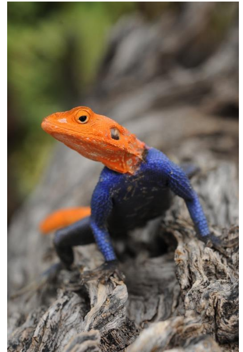
Namibian Rock Agama

Rising from the beautiful Drakensberg Mountains in Lesotho, forming part of the international border between South Africa and Namibia, the Orange River is the longest river in South Africa. The Orange River Basin extends into Namibia and northern Botswana. The river snakes its way through one of Southern Africa's harshest