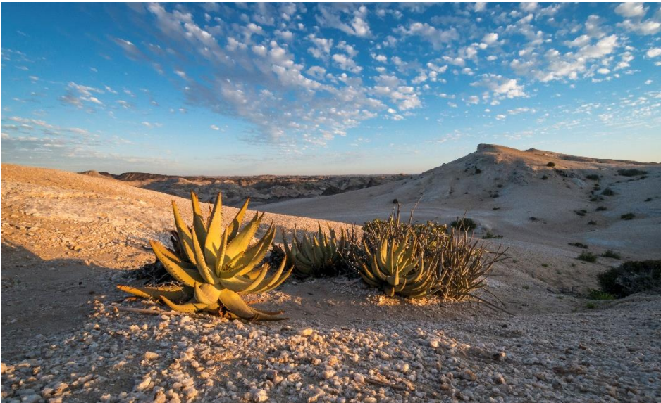
Aloes along the moonscape

Main Targets: Peringuey's Adder ( Bitis peringuey ), Horned Adder ( Bitis caudalis ), Namib Sand Snake ( Psammophis namibensis ) various endemic Geckos ( Pachydactylus sp. / Ptenopus sp. / Chondrodactylus sp.), Namaqua Chameleon ( Chameleo namaquensis ) as well as Day Geckos ( Rhoptropus sp.).