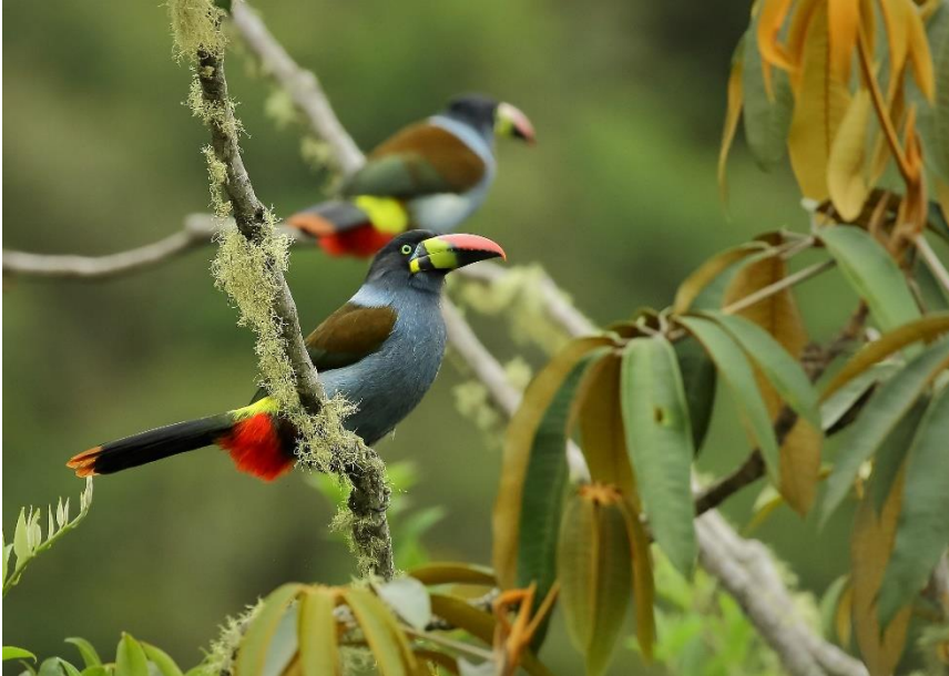
Gray-breasted Mountain Toucan

With 1,800 bird species, Peru is one of the most avian rich countries on earth. This birding tour takes us across the eastern slopes of the Andean Mountains, high above the sweeping lowlands of the Amazon Rainforest, and descends through mystical cloud forests into the western edge of the Amazon basin. Here, regular swathes of clouds cloak the canopy in a dense mist, giving life to an abundance of mosses, lichen, bromeliads, orchids and more, and providing home to mountain toucans, golden-headed quetzals, and huge, roving mixed flocks of colorful tanagers and other species. Amongst the gnarled branches of the forest, Spectacled Bears, Gray Woolly Monkeys and vibrant orange Cock-of-the-Rocks still live unmolested.