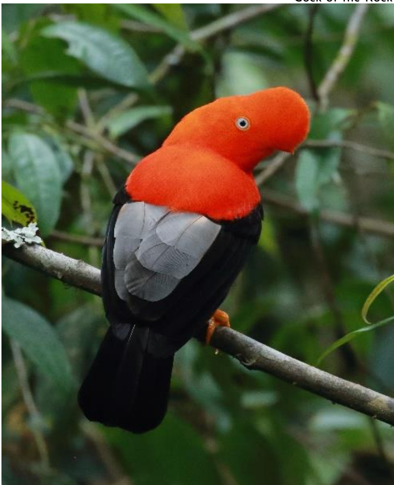
Cock of the Rock

Meals: Breakfast, Lunch, Dinner Lodging at Casa Andina