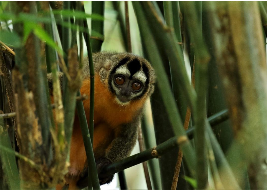
Black-headed Night Monkey

archaeological spectacles extant. The historic 15th century Inca sanctuary is a place that captivates not only for its dazzling architectural beauty, but also for its important historical-cultural legacy, which has led it to be recognized as a UNESCO World Heritage Site and admired worldwide.