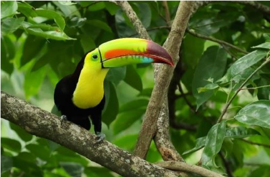
Temple of the Great Jaguar

Black-throated Shrike-Tanager, Red-crowned Ant-Tanager, Red- throated Ant-Tanager.