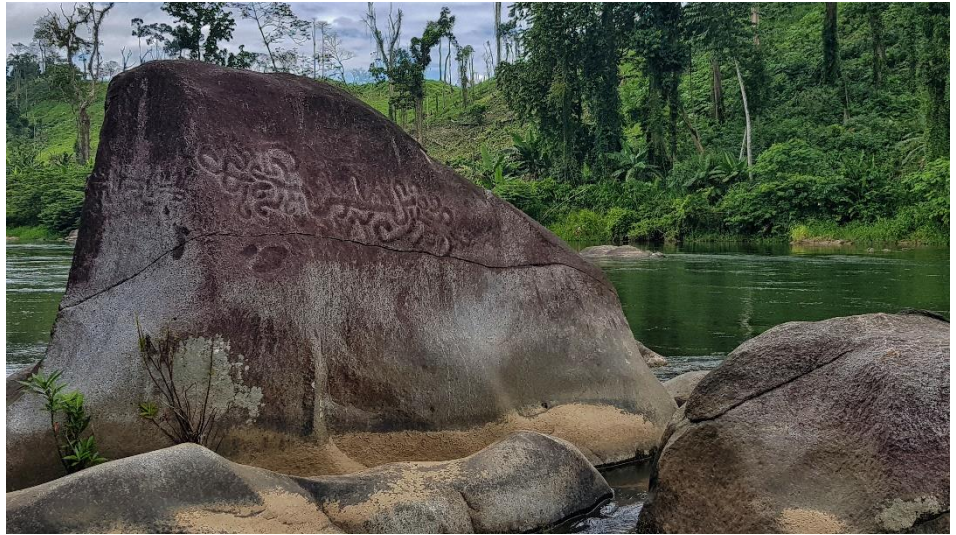
Rio Platano Petroglyphs

Day 1: Arrive San Pedro Sula (SAP), transfer to La Ceiba Day 2: La Ceiba to Raista Day 3: Raista to Las Marias Day 4: Birding Las Marias Day 5: Birding Pico Dama Day 6: Rio Platano Petroglyphs Day 7: Birding Wipatara Day 8: Return to La Ceiba/Pico Bonito Day 9: International flights home