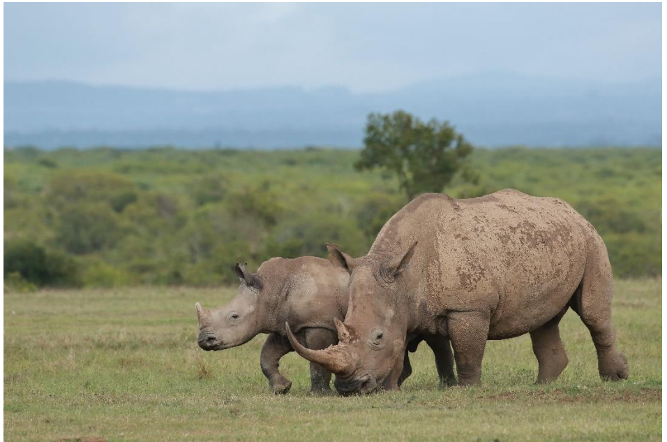
Southern White Rhino

Day 16: Transfer to airport (NBO) for afternoon/evening flights home