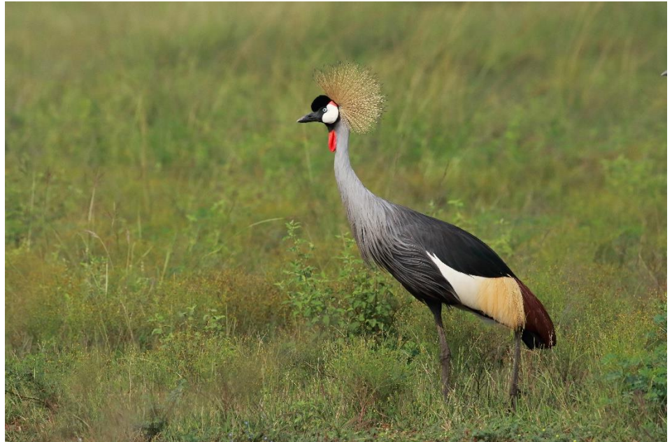
Gray Crowned Crane

After an early breakfast we drive a few minutes to Kibale National Park visitor center for an important orientation from our guide, and then set out with high hopes of encountering one of the several family groups tolerant of people. Humans and Chimpanzees share a remarkable 98% of their DNA, making them our closest living relative. As such, tracking and observing these amazing primates can be an intimate experience as we see adults interact and care for one another as they move through their forest home, often with babies in tow, grooming, feeding, resting, and playing. In addition to Chimpanzees, Kibale is home to 12 other primates such as the rare L'hoest's monkey and East Africa's largest population of the threatened Red Colobus Monkey. Other primates here include the Guerezza Colobus, Blue monkey, Grey cheeked Mangabey, Red tailed monkey, Olive Baboon, Bushbabies and Pottos. Our tracking activity may last for up to several hours. If we do end our time with the Chimpanzees early enough, birding the adjacent Bigodi wetland is also productive with many riverine forest birds such as Speckle-breasted Woodpecker, Cabanis's Greenbul and Joyful Greenbul as well as White-spotted Fluff tail, Dusky and Olive Long tailed Cuckoo, Lesser Honeyguide, Blue-shouldered Robin Chat, White-chinned Prinia, Grey Apalis, Olive-green Camaroptera and White-collared Olive back.