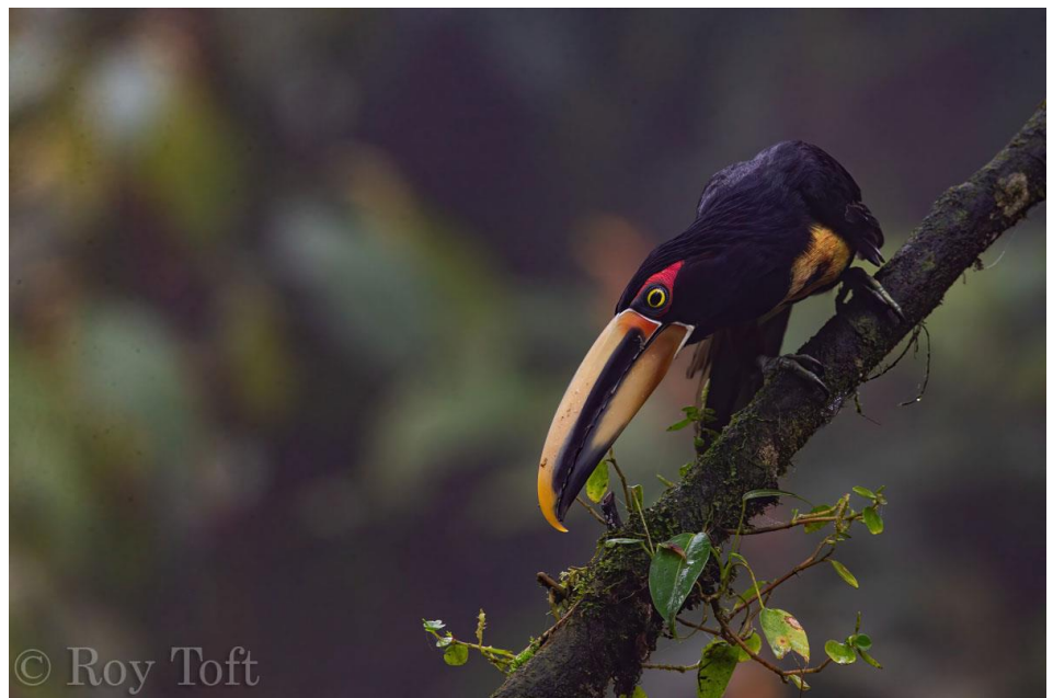
Pale Mandibled Aracari