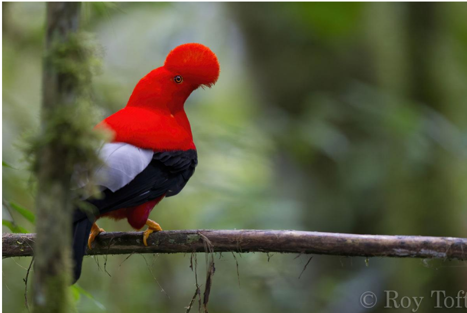
Andean Cock of the Rock